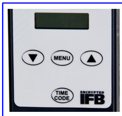
Figure 1-1 ERXI Keys

Each menu has several pages allowing you to change configuration settings. All of these settings are stored in Flash ROM immediately after making the change.