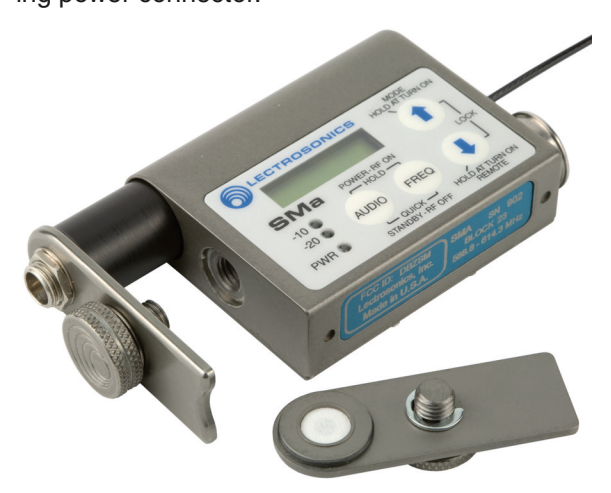
The battery eliminator assembly mounts in place of the standard battery door.

The SMBATELIM provides regulated 1.8 volts DC up to 1 amp to power all SM Series transmitter models for extended or continuous operation. The assembly is mounted to the transmitter housing in the same manner as the standard battery door. Circuitry is contained in a cylindrical housing in place of an AA battery, with a locking power connector.